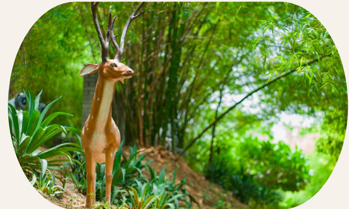
Deer Trail View