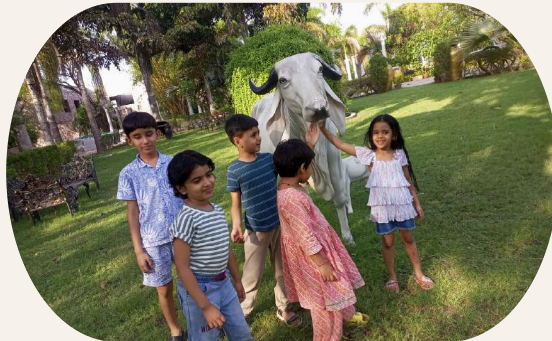
Cow Sculpture Lawn