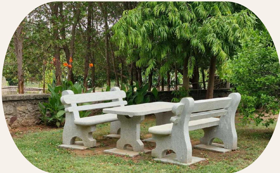
Stone Bench Nook