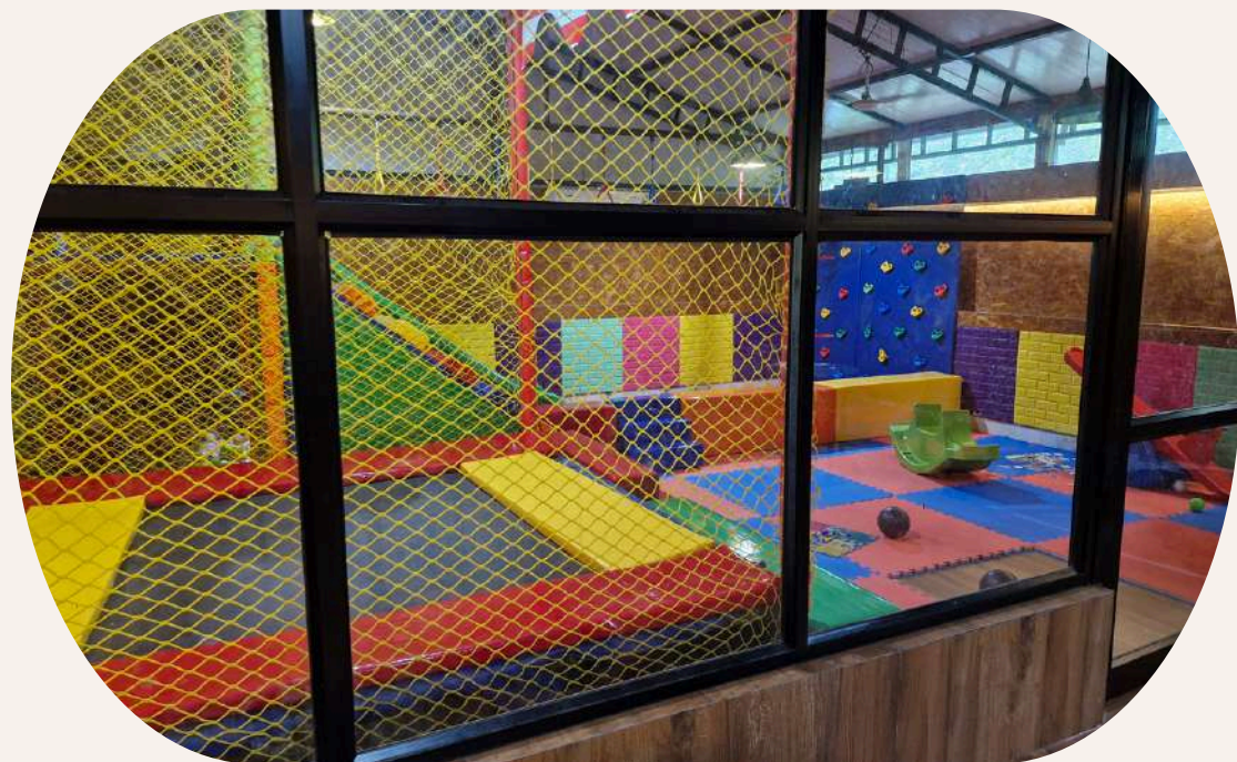
Indoor Kids Play Area