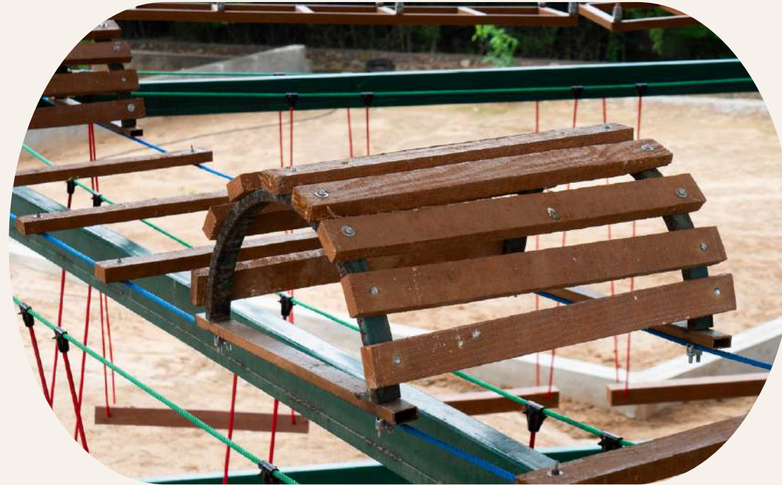
Burma U Bridge