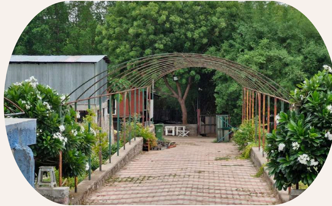
Green Archway Walk