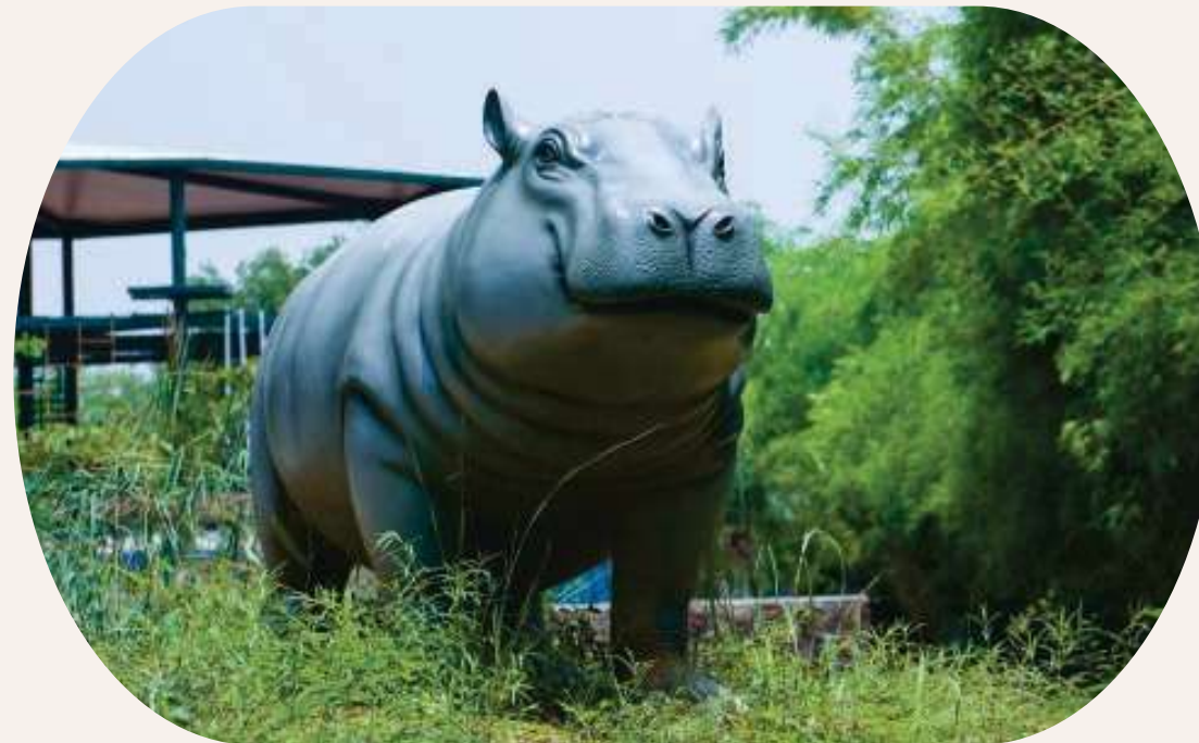
Happy Hippo Zone