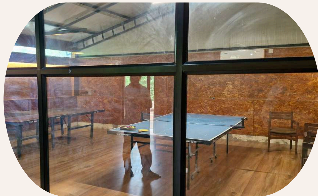
Table Tennis Room