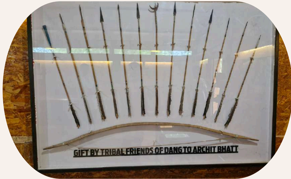
Tribal Legacy Wall