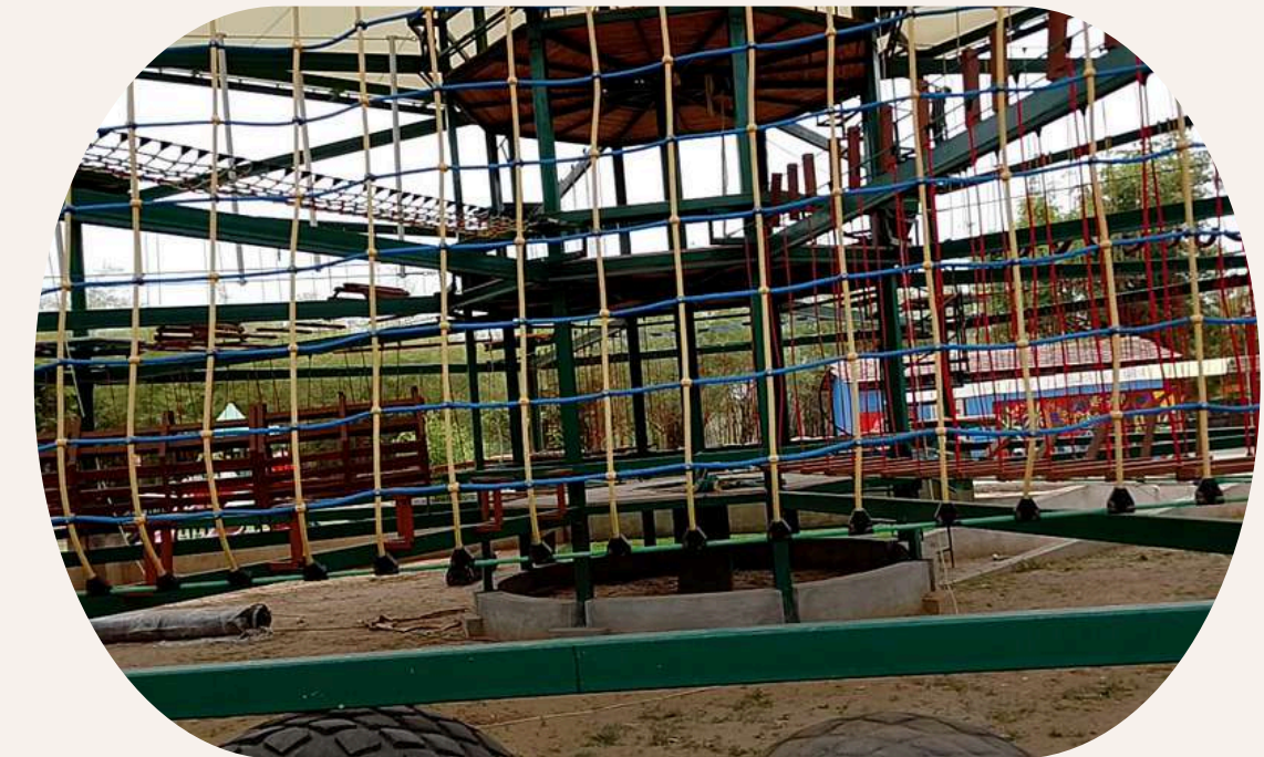
Net Web Crossing