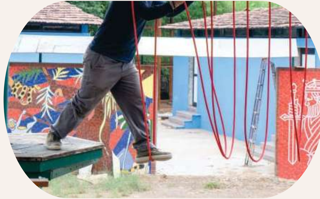
Adventure Rope Walk