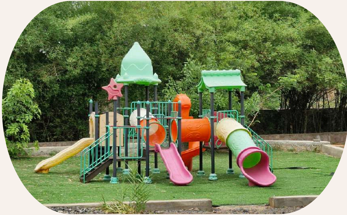
Kids Play Zone