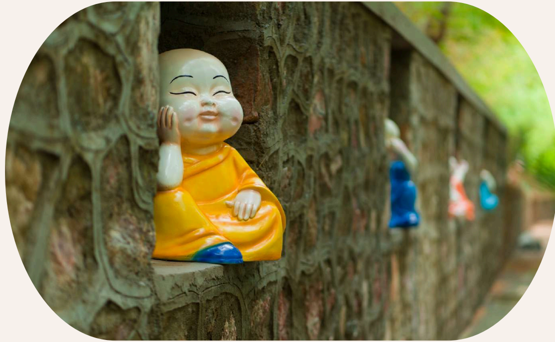
Monk Statue Wall