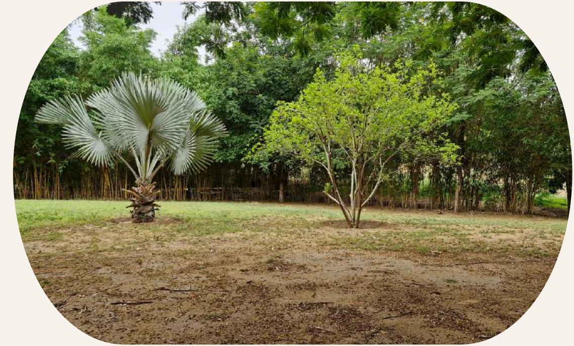
Palm Grove Clearing