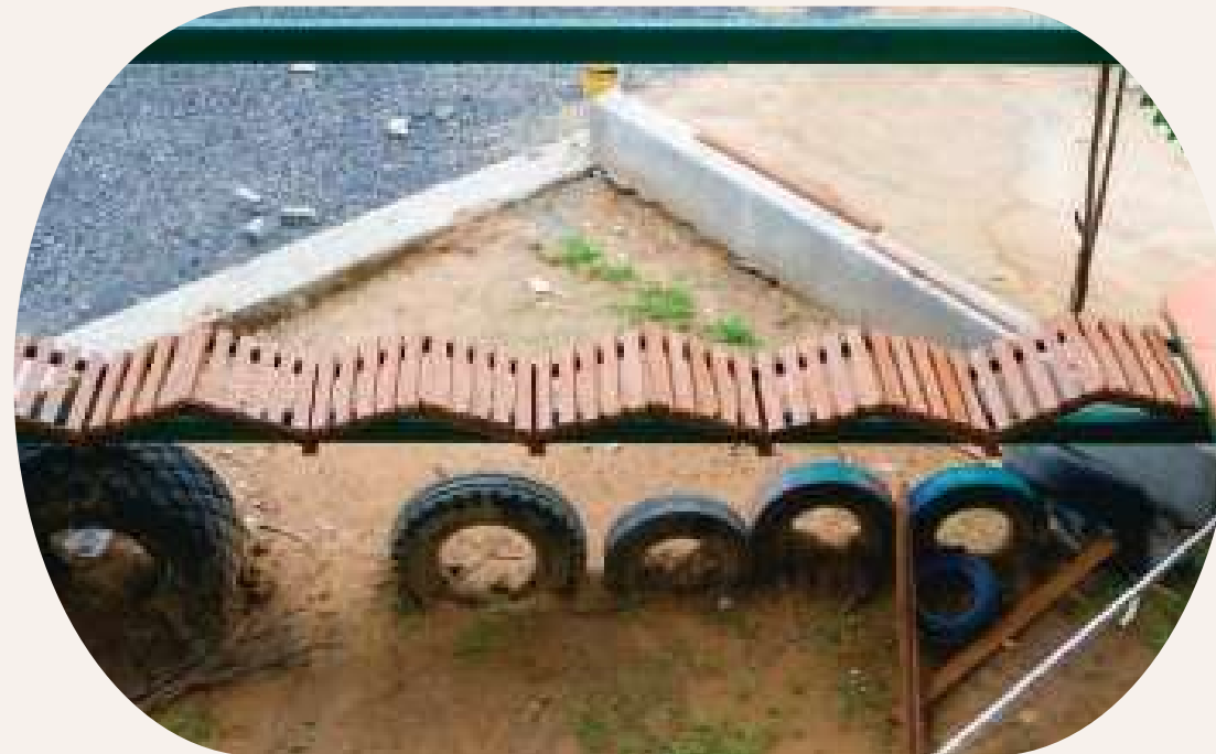
Zig Zag Bridge