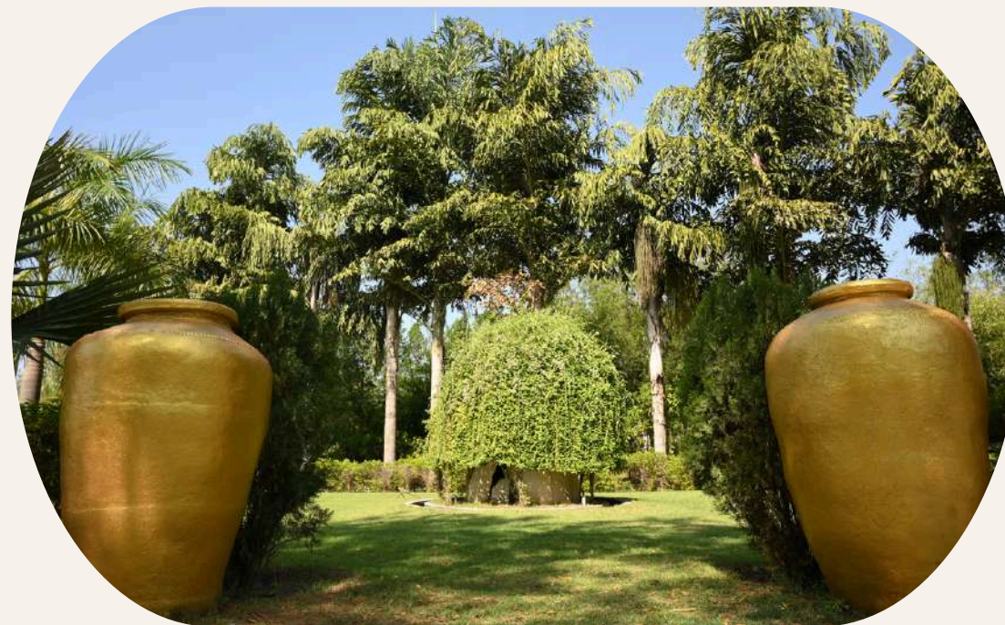
Golden Pot Garden Path