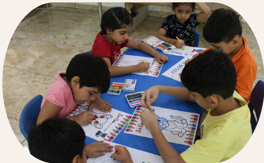
Kids Art Activities